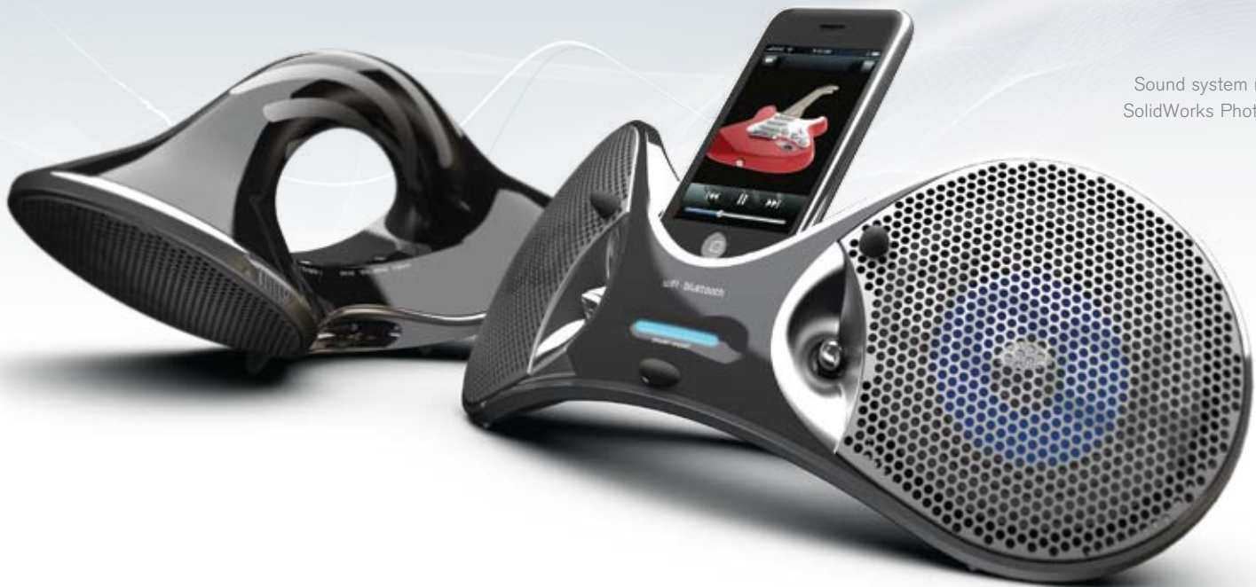
Sound system rendered in SolidWorks PhotoView 360

THE COMPLETE 3D CAD SOLUTION FOR DESIGNING BETTER PRODUCTS